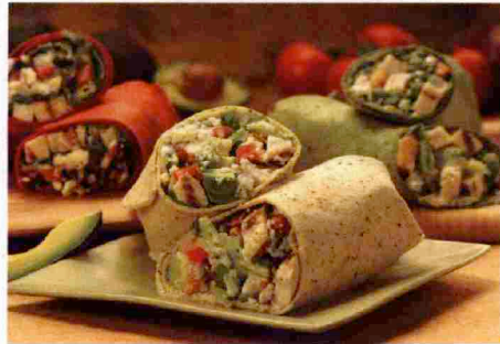
COLORFUL SANDWICH WRAPS AT NATURE'S TABLE CAFE

In addition to a large assortment of flavors and sizes, operators can choose from frozen, refrigerated and shelf-stable products. Mission Foods, a major supplier, suggests that refrigerated tortillas be stored in the walk-in at 35° to 40°. Both refrigerated and frozen product