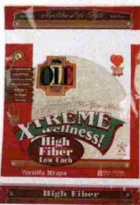
NEW FROM OLÉ MEXICAN FOODS: HIGH FIBER TORTILLAS

should be brought to room temperature, in their packaging, for 4 to 6 hours before using.